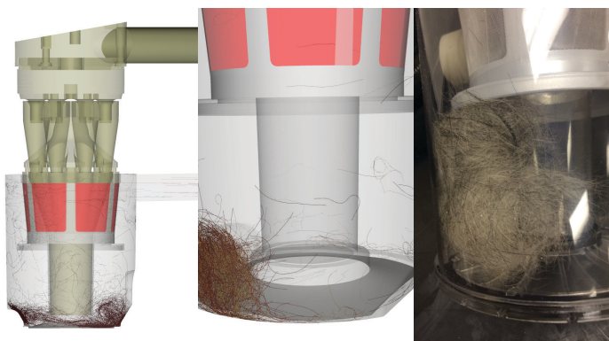
Figure 1. Model validation comparing the simulation with the laboratory tests.

The simulations predicted improved efficiency for a modified geometry, compared to initial geometry. Using Rocky-Fluent coupling as a tool for hair modeling enables conceptual device testing, reducing the number of lab-tested prototypes and, therefore, minimizing development time and cost.